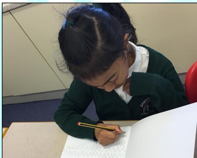
Ata (1AM) – I like to learn from different artists like Esther Mahalangu!