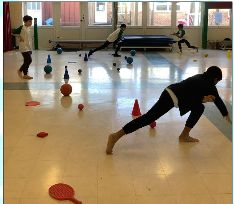
Children lunging their way through the obstacles.