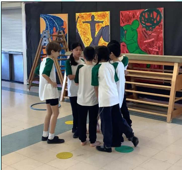
'Team Red' discussing how they are going to move effectively around the space in order to gain victory!

Shambo (5T) – I liked how we learnt about different ways of moving and then using them within a game!